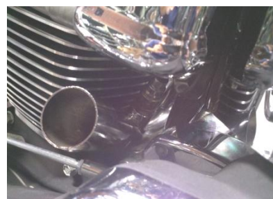
Fig 1.5 install crossover pipe

Note: use good and safe practices when removing and installing your new exhaust system to prevent injuries that includes but is not limited to such safety glasses and gloves. When installing make sure gloves are not abrasive or damage may occur like scratching parts. Always secure motorcycle before any work is done.