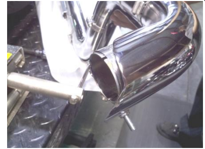
Fig 1.8 install clamp as shown on left side pipe bolt must face towards the engine to be able to be tighten

Note: Be sure to tighten all hardware before starting your engine. Retighten after the first 100 miles.