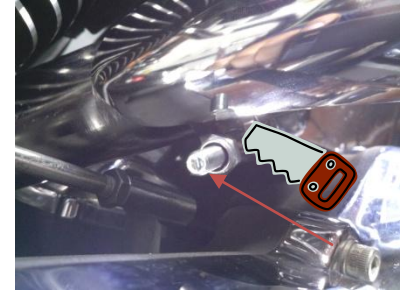
Fig 1.9 tighten T-bolt clamp and if you wish cut the end of the bolt threads flush with the nut

At freedom performance Inc. attempts have been made to provide enhanced concerning Clearances. However, due to some designs and space boundaries, ground and cornering clearance may not be improved and in some cases may even be reduced.