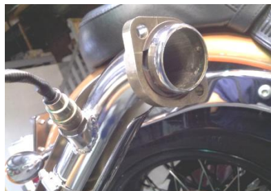
Fig 1.3 install flange and retaining ring